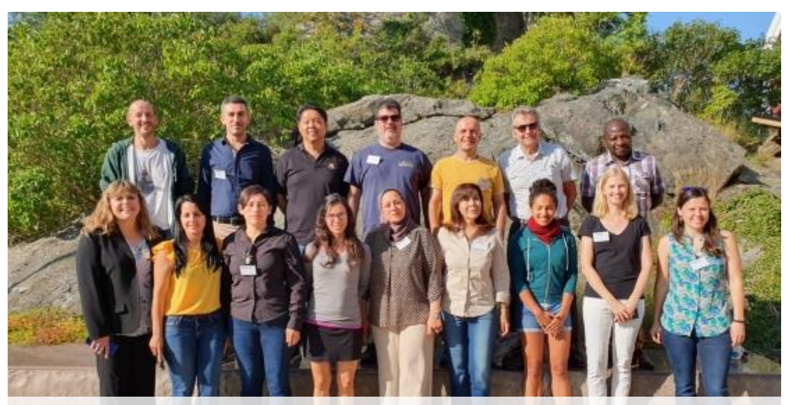
The participants of a new Coordinated Research Project (CRP) met in Kristineberg, Sweden to kick off the 4-year project.

The latest news and updates from the OA-ICC and partners