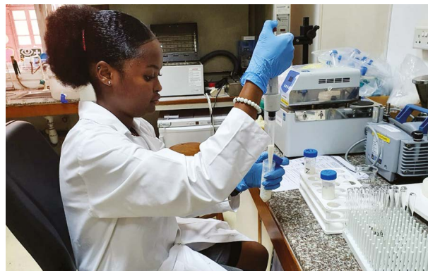
Scientist from the Seychelles Public Health Laboratory conduct milk testing to promote food safety.

2019: Seychelles establishes a national register and inventory of radiation sources.