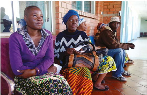
Patients await treatment at the Cancer Diseases Hospital in Lusaka, Zambia.