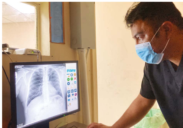
The IAEA has supported Belize in improving the quality of diagnostic imaging services as part of the Agency's response to the COVID-19 pandemic.

2015: BAHA inaugurates a new Biosafety Level 2 molecular laboratory at Central Farm in Cayo to detect diseases using nuclear derived techniques.