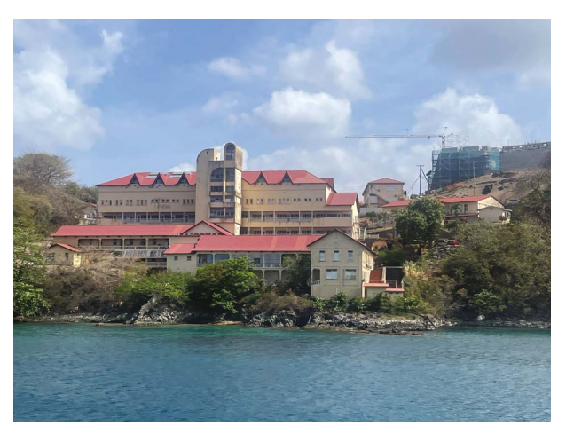
The Grenada General Hospital which is being supported by the IAEA to establish a comprehensive quality assurance programme for radiology.