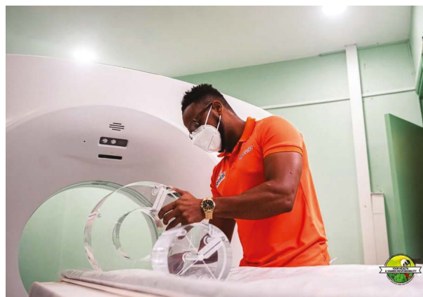
CT scanner provided to the Milton Cato Memorial Hospital.

2022–2023: Diagnostic radiology equipment is provided to the Milton Cato Memorial Hospital, including a CT scanner, a Double Contrast Injector System and a mammography unit.