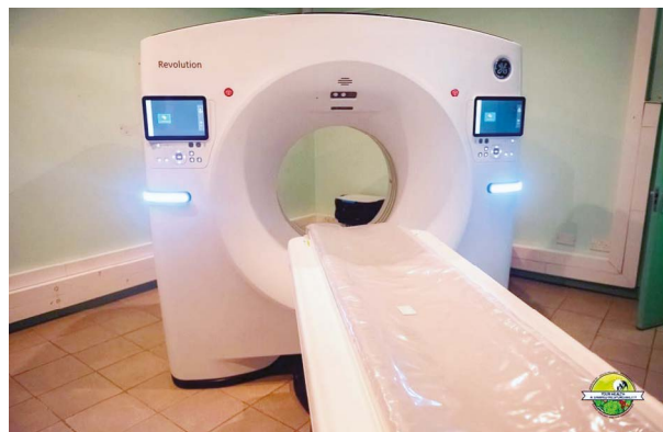
Diagnostic radiology equipment provided to the Milton Cato Memorial Hospital with IAEA support.