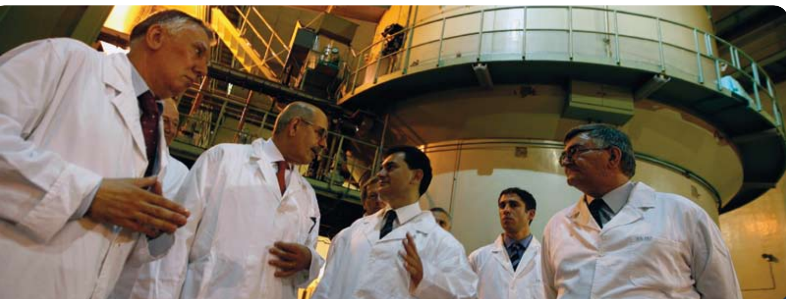
From Top: Dr. ElBaradei with members of staff of the Chinese Institute of Atomic Energy (China, December 2006.); Planting a sapling at the Kenya Agricultural Research Institute (Muguga, Kenya, 24 July 2009.); Visiting the IAEA's radiation monitoring and protection services laboratories (Vienna, Austria, 21 November 2008.); Checking progress at the IAEA's largest-ever Technical Cooperation programme in Vinča, Serbia. (Vinča, Serbia, 2 July 2009.)