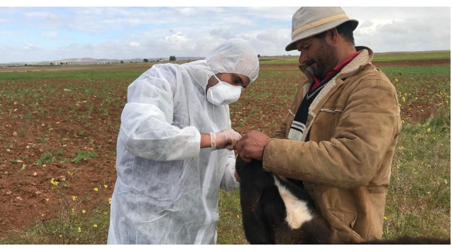
Taking a sample from a cow to test for foot-andmouth disease.