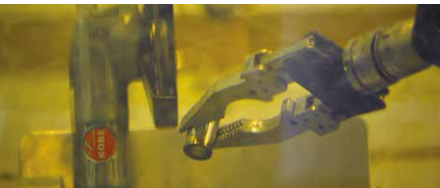
The team successfully extracts the source from the medical device.