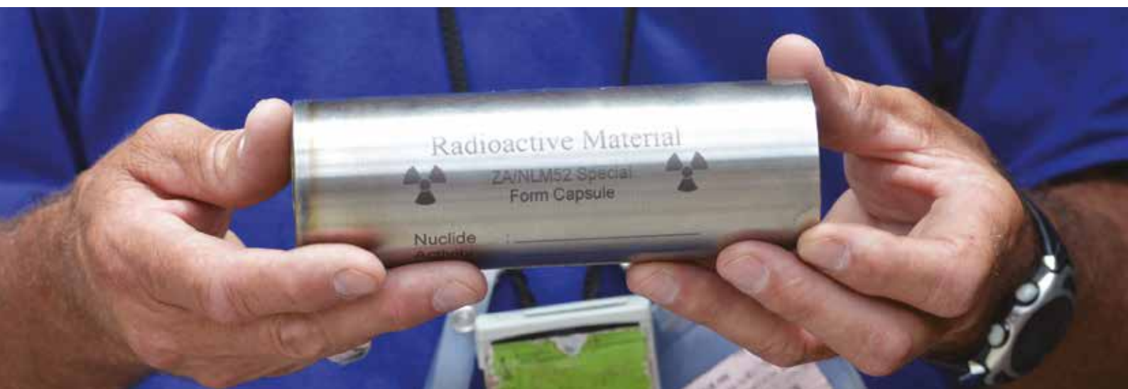
Once the sources have been removed they are placed into protective capsules within the hot cell.