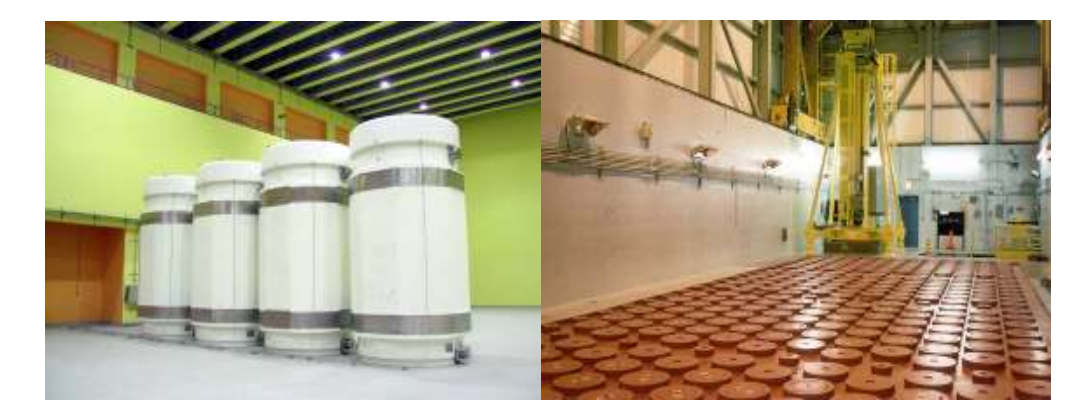
Figure 2. Dry fuel storage technologies: casks at the ZWILAG facility in Switzerland (left) and the Fort St. Vrain vault in the USA (right).

of being modular, which spreads capital investments over time, and, in the longer term, the simpler passive cooling systems used in dry storage reduce operation and maintenance requirements and costs. Dry storage facilities use a variety of configurations including modular vaults, silos and casks. Figure 2 shows the casks at the ZWILAG facility in Switzerland and the Fort St. Vrain vault in the USA.