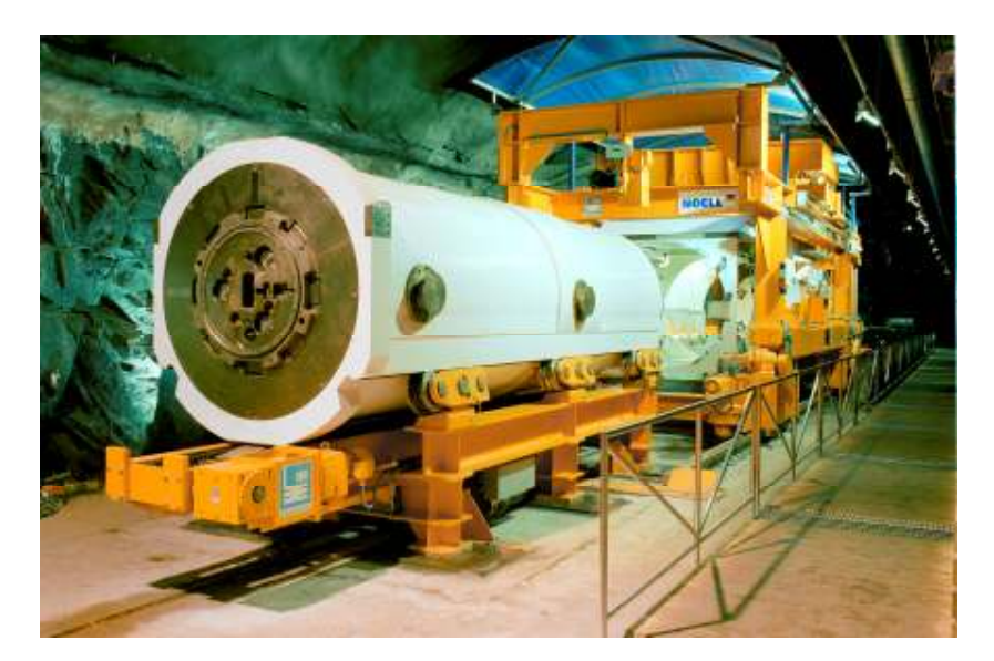
Figure 6. Prototype deposition machine for vertical disposal. The machine tilts the canister into the deposition hole.