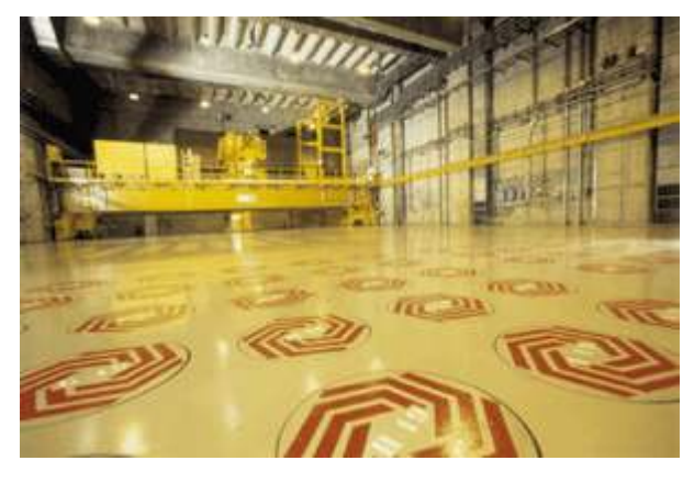
Figure 4. The storage hall for vitrified waste at La Hague.

15. Figure 4 shows the storage hall for vitrified waste at La Hague. Canisters are stored in vaults, each with a number of channels, the round tops of which are visible in the picture. Each channel can hold up to twelve canisters stacked on top of each other. The storage facilities are modular, so that they can be extended as the need arises, and very compact. The technology used permits storage of all vitrified waste from 50 years' operation of France's 59 nuclear power plants on an area the size of a rugby field.