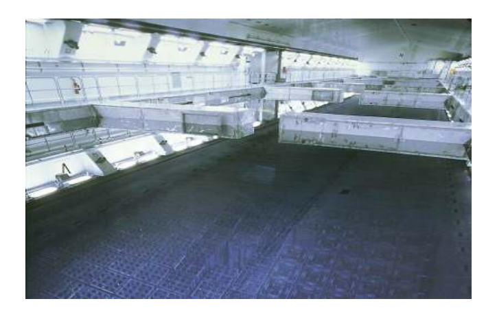
Figure 1. The pool at the CLAB wet storage facility in Sweden.

8. There are two storage technologies in use today: wet storage in pools or dry storage in vaults or casks. There are now more than 50 years of experience with wet storage of spent fuel in water pools. Figure 1 shows the pool at the CLAB wet storage facility in Sweden. Wet storage is a mature technology, and likely will continue to be used for many years. However, as delays are incurred in implementing plans for geologic repositories and for reprocessing, storage of spent fuel for extended durations of several decades is becoming a reality. This trend of more storage for longer durations is expected to continue, and some countries are now considering storage periods of 100 years or more. While no significant problems are anticipated with extended wet storage, it is important to monitor these facilities, learn from experience and apply the results in designing and operating newer facilities, from the beginning, for extended storage.