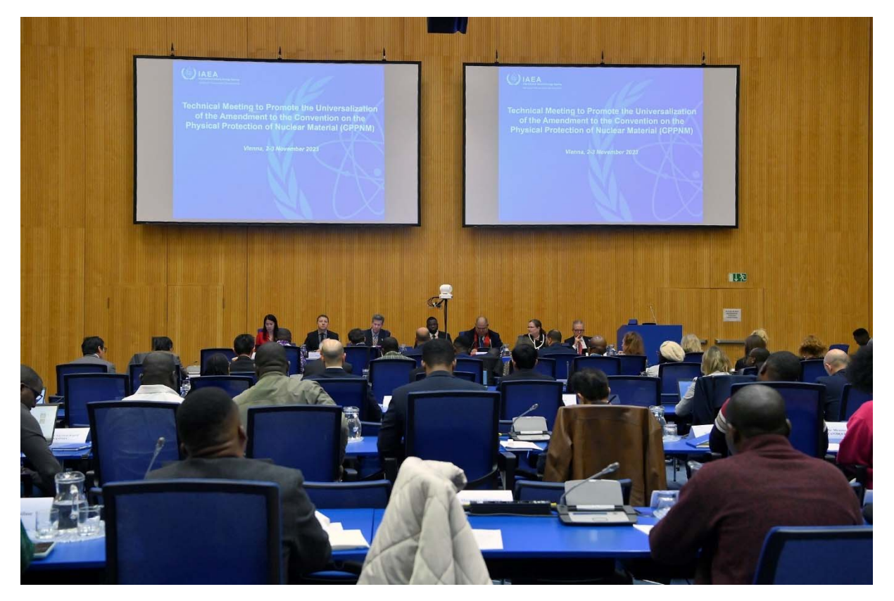
A Technical Meeting to Promote the Universalization of the Convention on the Physical Protection of Nuclear Material (CPPNM) and its Amendment was held in Vienna in November 2023.

18. In October–November 2023, the Agency convened a Technical Meeting of the Representatives of Parties to the Convention on the Physical Protection of Nuclear Material (CPPNM) and the CPPNM Amendment (Points of Contact Meeting) in Vienna to facilitate discussions and experience sharing on various matters within the scope of the CPPNM and its Amendment.<sup>17</sup>