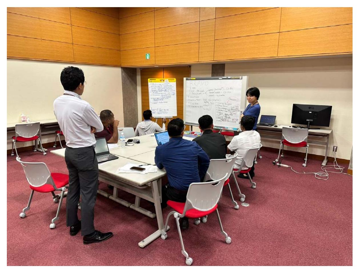
A Regional Workshop on Developing a National Framework for Managing the Response to Criminal or Intentional Unauthorized Acts Involving Nuclear or Other Radioactive Material was held in Tokai, Japan in August–September 2023.

84. The Agency provided continued assistance to 7 Member States with physical protection upgrades at nuclear facilities. These upgrades are complemented by specialized technical training to support the operation, maintenance and sustainability of physical protection equipment, systems and measures for detection, delay and response.<sup>83</sup>