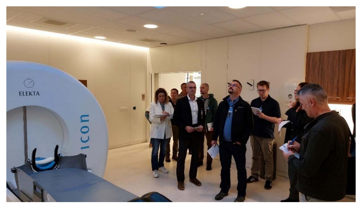
The IPPAS team visited the Kingdom of the Netherlands Cancer Institute in Amsterdam during the IPPAS mission in the Kingdom of the Netherlands in October 2023.

27. The Agency continued communication and outreach about its nuclear security activities through the available platforms, including the Agency website, social media and NUSEC. Specifically, the Agency issued 11 press releases and 24 articles on nuclear security-related topics on its website, as well as an edition of the IAEA Bulletin entitled Nuclear Security Shaping the Future . All IPPAS and INSServ missions conducted in Member States were communicated to the media and the public through press releases, subject to confidentiality requirements between the Agency and Member States. New security-related publications were communicated to a broad audience through the Agency's social media accounts.<sup>26</sup>