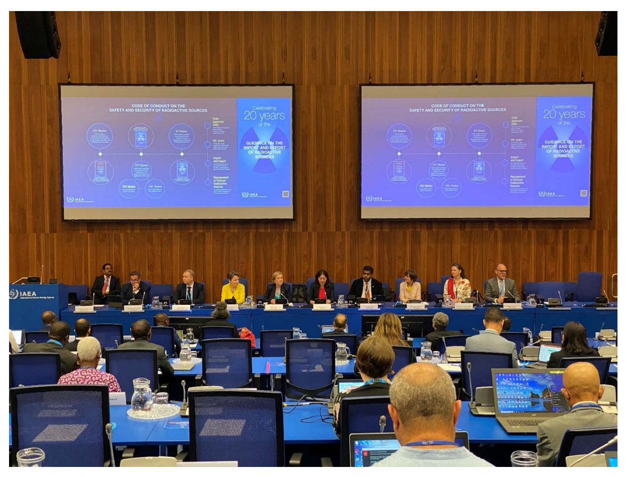
The Technical Meeting of Technical and Legal Experts on Implementing the Guidance on the Import and Export of Radioactive Sources took place in Vienna in May 2024.

56. The Agency addressed two new requests related to strengthening physical protection at facilities with high activity radioactive sources in use and storage. The Agency assisted in the removal of 15 high activity disused radioactive sources from 2 States, continued to support the ongoing removal of 9 high activity disused radioactive sources in 1 State and initiated the preparatory work for the removal of an additional 44 sources from 8 States.<sup>55</sup>