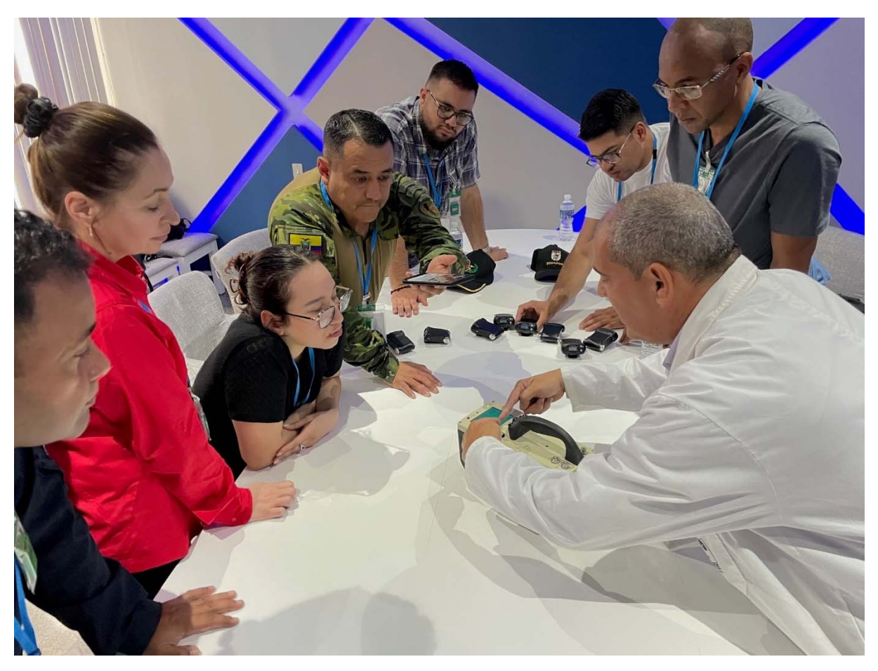
An International School on Nuclear Security was held in Havana in February–March 2024.

78. During the reporting period, the Agency continued to strengthen its results based management approach. Specifically, the Agency implemented pre- and post-training knowledge tests for selected courses to quantify the increase in knowledge among trainees resulting from instruction. In addition,