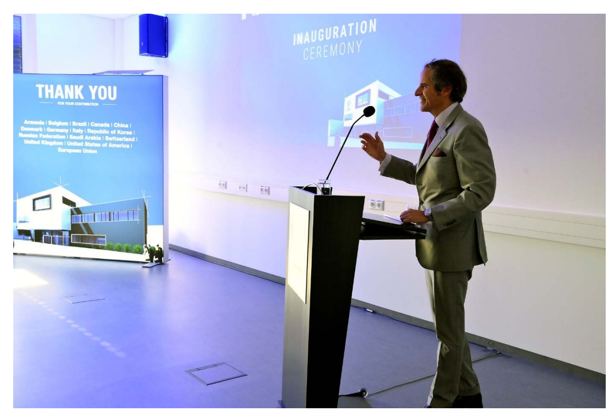
The NSTDC was inaugurated on 3 October 2023.

43. During the reporting period, the Agency focused on enhancing its offering of train-the-trainers courses and workshops in order to amplify capacity building efforts through increased impact.<sup>42</sup> The Agency conducted several train-the-trainers events, including: