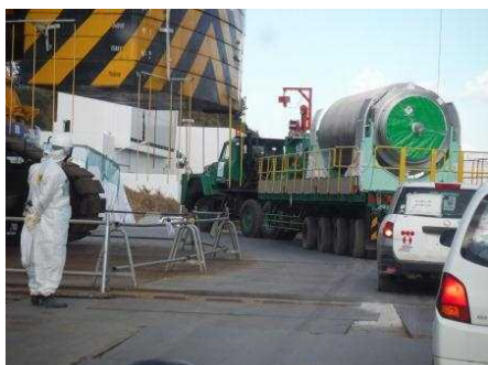
Transferring a cask with fuel assemblies

The NRA will continue to be vigilant about TEPCO's decommissioning activities.