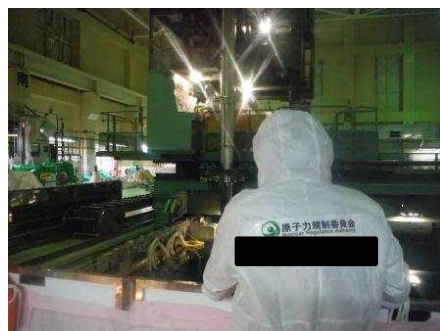
An NRA safety inspector inspecting the operation