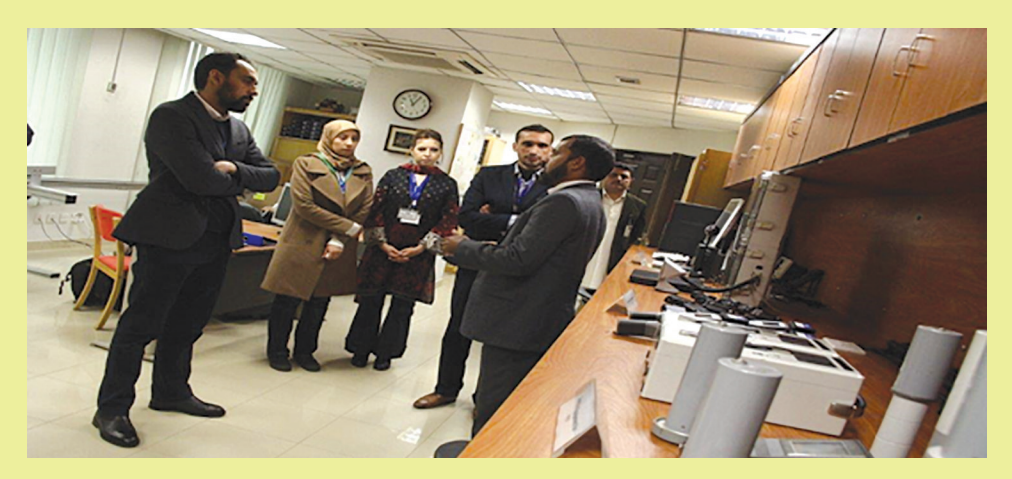
Figure 7 – Training course on Sustainability of Radiation Detection Equipment and expert support capabilities at PNRA