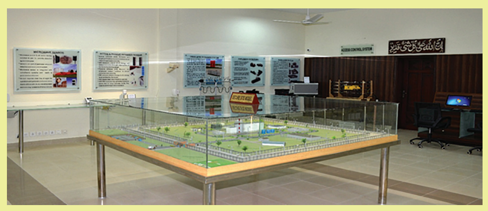
Figure 9- Physical Protection Systems Laboratory – PCENS