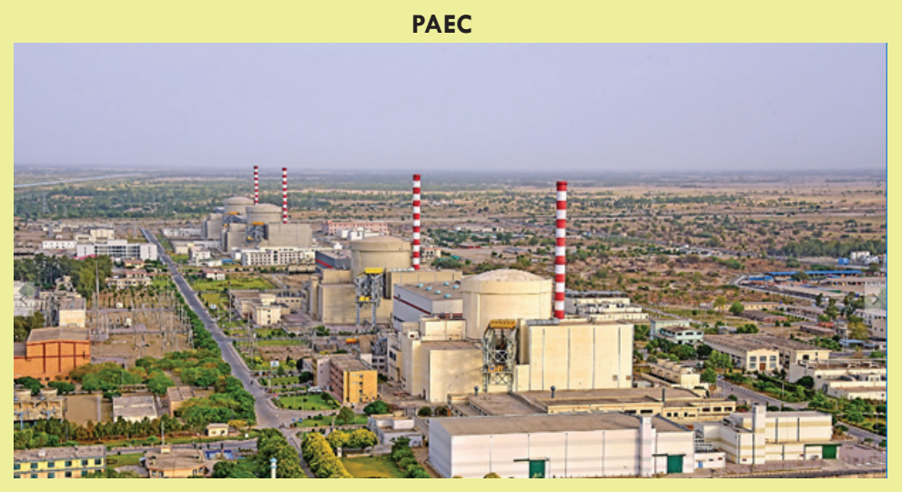
Figure 1 - Chashma Nuclear Power Complex