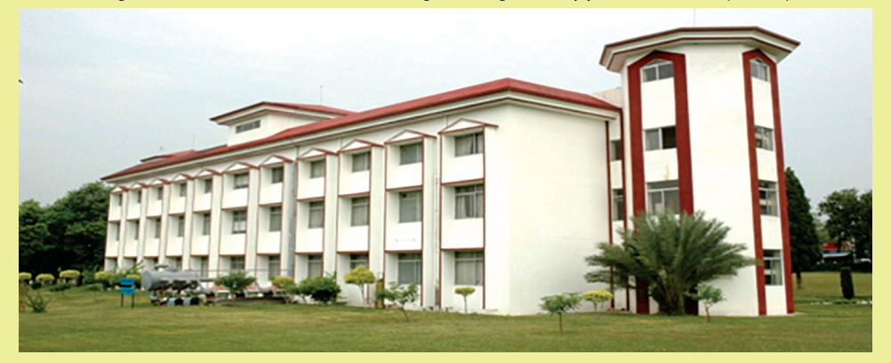
Figure 14- PIEAS