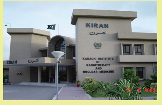
Figure 3 – Nuclear Medical Centre at Karachi