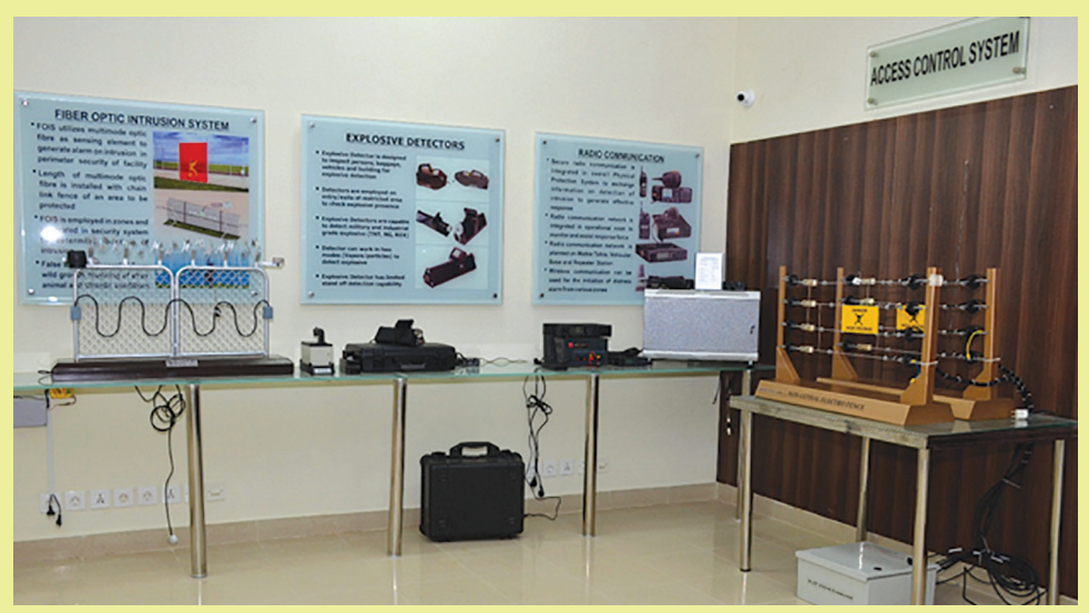
Figure 10 - Physical Protection Systems Laboratory – PCENS