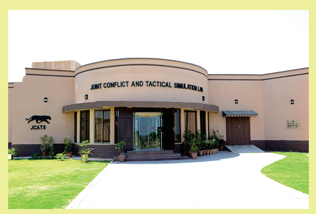
Figure 11 - Joint Conflict and Tactical Simulation Laboratory – PCENS