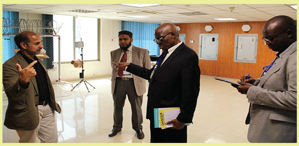
Figure 6 – Nigerian delegation visit to Physical Protection Interior Laboratory (PPEL) at PNRA