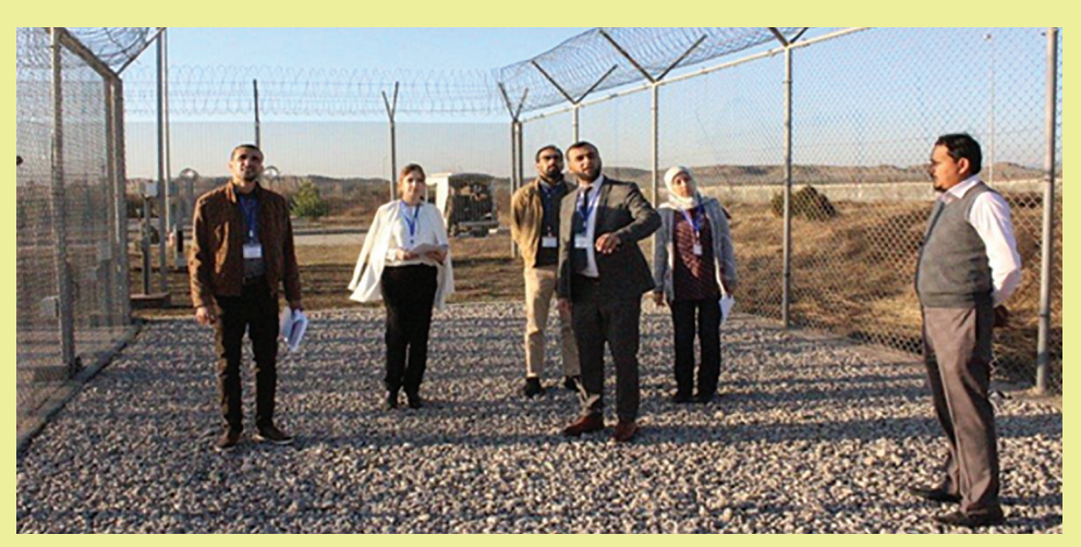
Figure 5: Training at Physical Protection Exterior Laboratory