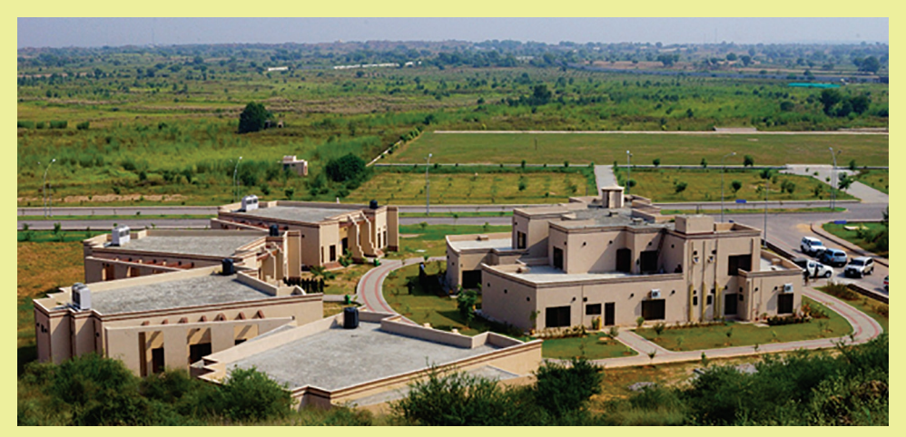
Figure 8 - Pakistan Centre for Nuclear Security (PCENS)