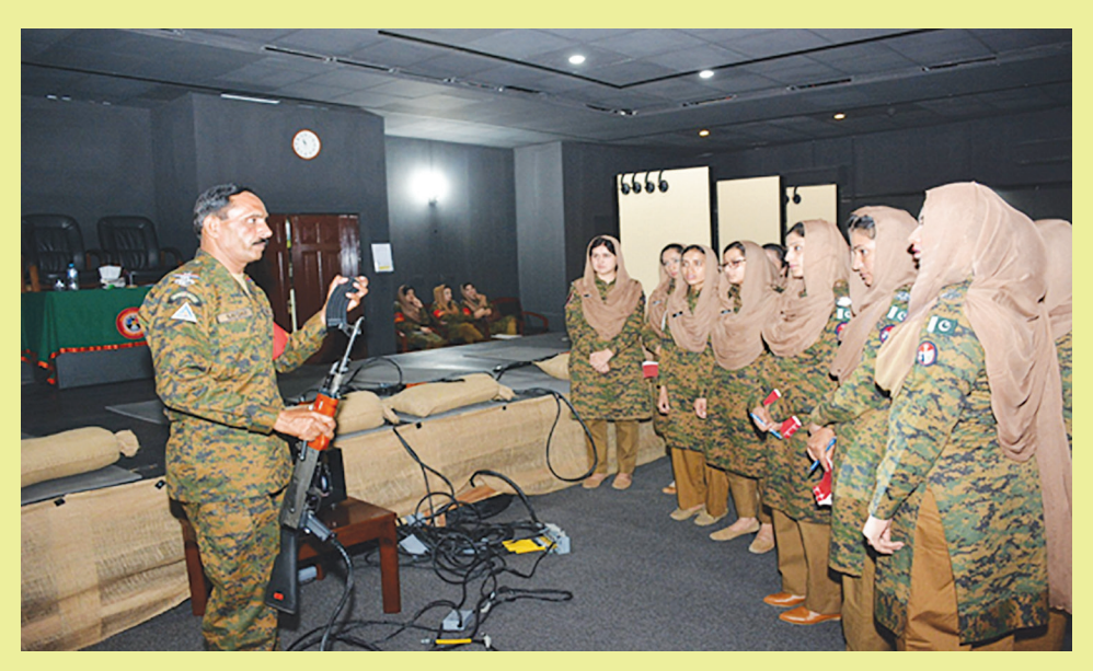
Figure 12 - Training at MEGGITT Weapon Simulator