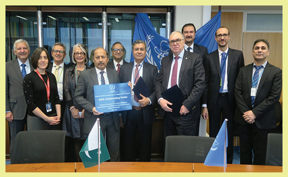
Figure 15 - Ceremony for PIEAS as IAEA Collaborating Centre for assistance in nuclear technologies