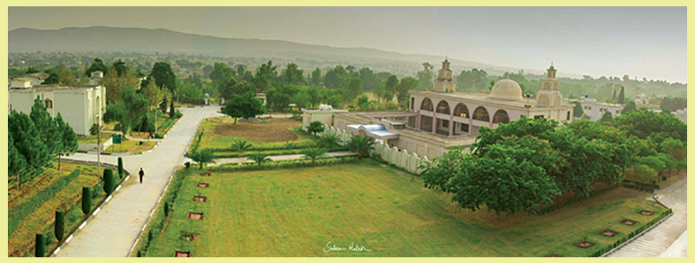
Figure 13 - Pakistan Institute of Engineering and Applied Sciences (PIEAS)