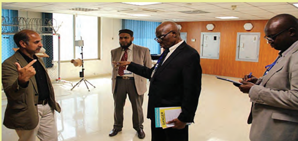
Figure 6 – Nigerian delegation visit to Physical Protection Interior Laboratory (PPEL) at PNRA