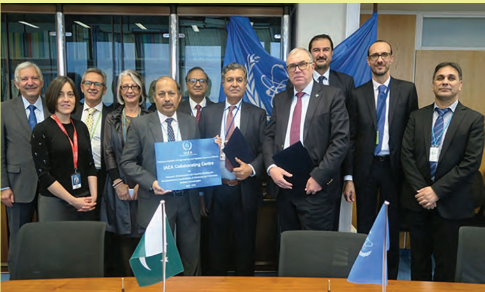
Figure 15 - Ceremony for PIEAS as IAEA Collaborating Centre for assistance in nuclear technologies