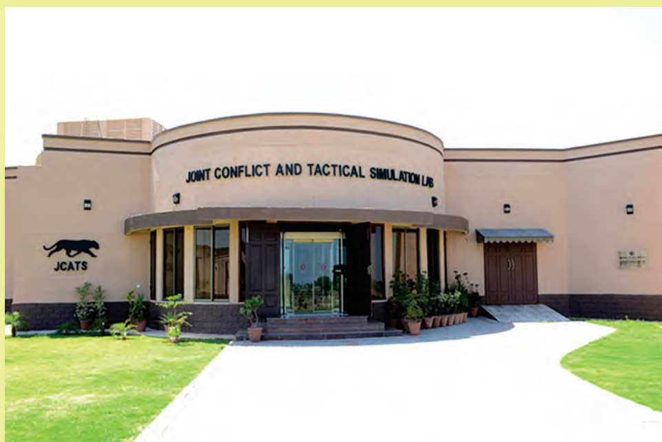
Figure 11 - Joint Conflict and Tactical Simulation Laboratory – PCENS