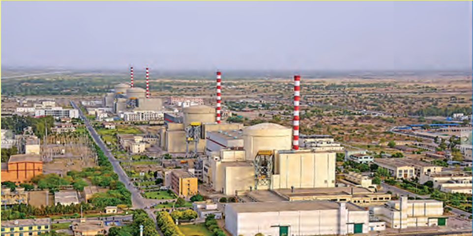
Figure 1 - Chashma Nuclear Power Complex