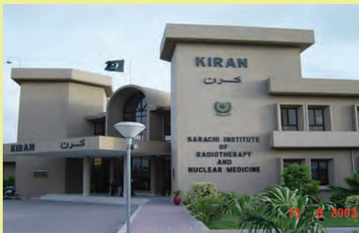
Figure 3 – Nuclear Medical Centre at Karachi