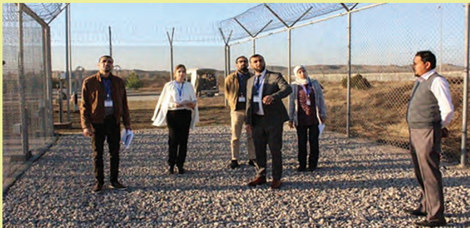
Figure 5: Training at Physical Protection Exterior Laboratory