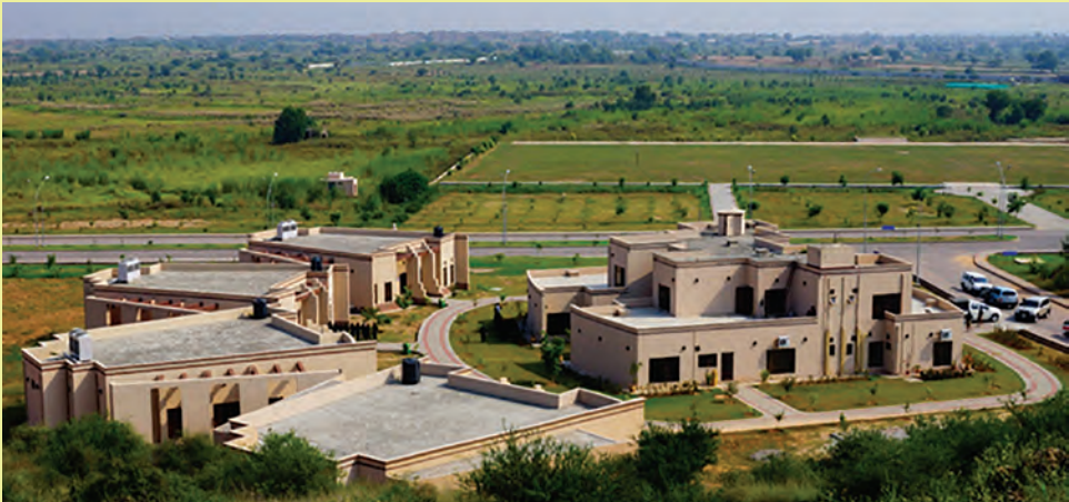
Figure 8 - Pakistan Centre for Nuclear Security (PCENS)