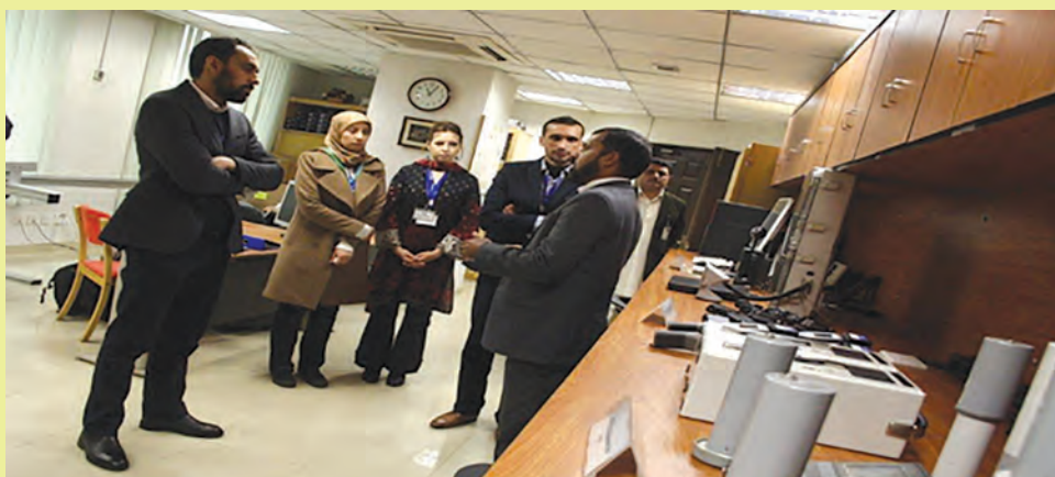
Figure 7 – Training course on Sustainability of Radiation Detection Equipment and expert support capabilities at PNRA