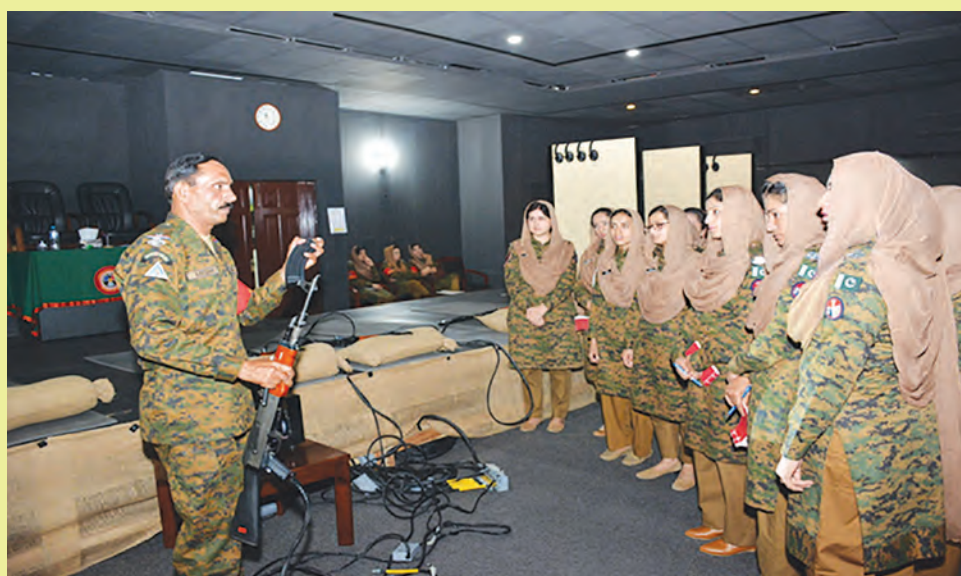
Figure 12 - Training at MEGGITT Weapon Simulator