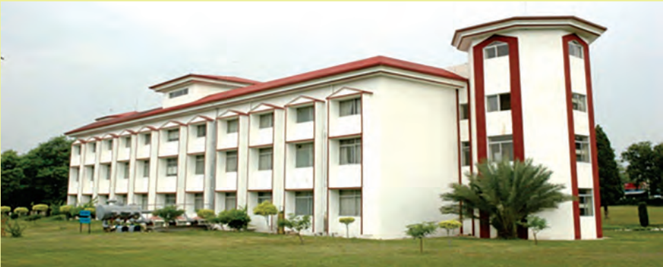
Figure 14- PIEAS