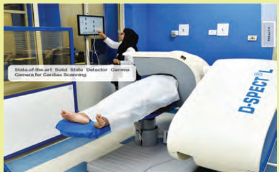
Figure 4 – Operation of Gamma Camera for Cardiac Scanning