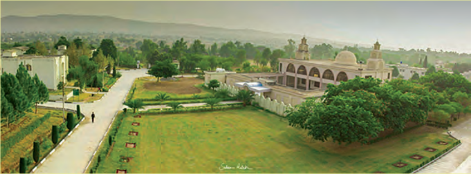
Figure 13 - Pakistan Institute of Engineering and Applied Sciences (PIEAS)