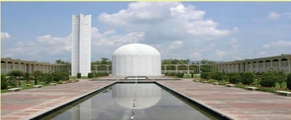
Figure 2 - Pakistan Institute of Nuclear Science and Technology (PINSTECH)