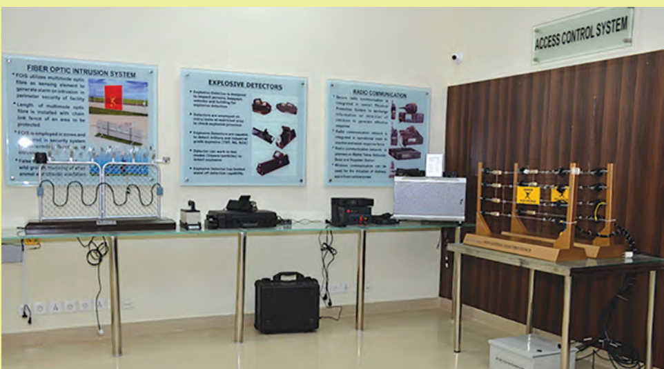
Figure 10 - Physical Protection Systems Laboratory – PCENS