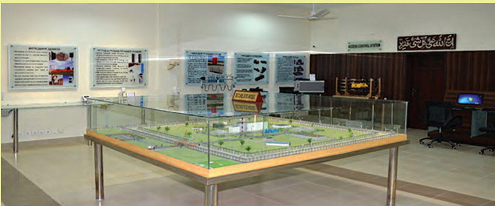
Figure 9- Physical Protection Systems Laboratory – PCENS