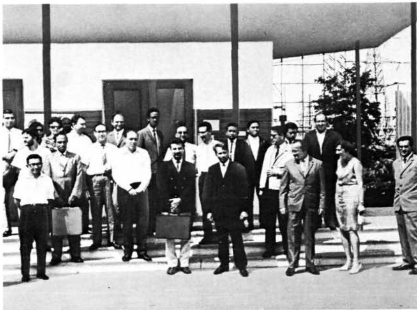
Outside the Novo-Voronezh reactor