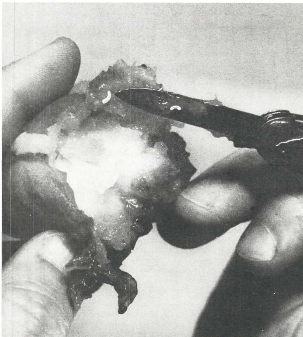
Damaged peach showing medfly larvae (near tip of blade and on blade).

the International Regional Organization against Plant and Animal Diseases (OIRSA), the Caribbean Plant Protection Commission (CEC) and the Tropical Agronomic Centre for Research and Training (CATIE) would all be involved in the operation of the UNDP project. Because containment of the medfly is a major component of the UNDP project proposal, a primary objective is the training of local personnel in quarantine and plant protection methods against the medfly. With the co-operation of the various agencies mentioned above, it is quite possible that the medfly populations can be kept at low enough levels so that the damage they cause is not economically significant and the continued northern movement of the medfly is checked. However, unless action is initiated soon, the medfly may escape its present boundaries.