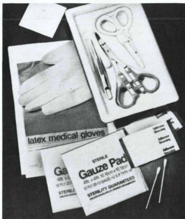
Nearly half of medical supplies and devices such as these are being sterilized by radiation in some countries.

Almost all cobalt-60 facilities installed in developing Member States through IAEA support are located administratively in the respective governmental establishments, such as the Atomic Energy Commission or the Ministry of Science and Technology. Consequently, their operation involves the "service sterilization" of medical products derived from local manufacturers. This implies that a close co-operation be maintained with facility customers at all stages, including education and technical guidance for specifications, compatibility, and standardization through good manufacturing practices and national regulation. Advisory group meetings and workshops, including one in Sri Lanka later this year, and regional co-operative projects for Member States help fulfil such promotional objectives and development of radiation technology well suited to upgrading local health care.