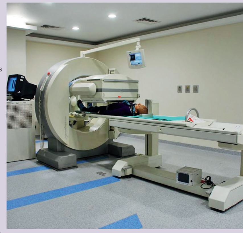
A gamma camera traces and detects radiopharmaceuticals to produce diagnostic images.

Radiation therapy, or radiotherapy, uses beams of radiation or radiation sources to target and kill cancer cells. When the therapy is applied to a cancerous growth or tumour, it is reduced in size or, in some cases, disappears altogether. Radiopharmaceuticals can also be used at higher dose levels to provide treatment. Careful calibration of these different therapy techniques help to target cancer cells while minimizing the radiation exposure to healthy cells.