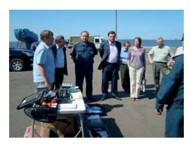
FIG. 1. Members of an EPREV mission team visiting the Arkhangelsk region of the Russian Federation.

State, whether or not the country has nuclear facilities.