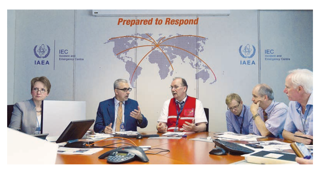
FIG. 2. Agency staff participate in a ConvEx-3 exercise hosted by Hungary in June to test the global emergency response to a simulated accident at a nuclear power plant.

International Emergency Response Exercise Report detailing the preparation, conduct and evaluation of the exercise.