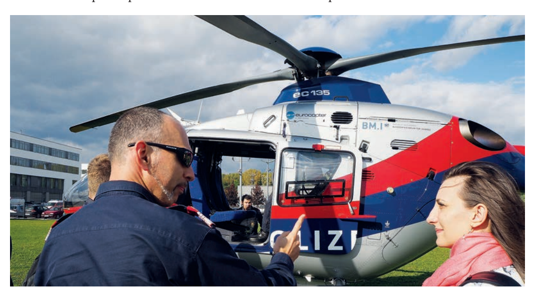
FIG. 1. The School of Radiation Emergency Management involved a technical visit to the Lower Austria Fire Brigade School (Niederösterreichische Landes-Feuerwehrschule) during the three week training course held in Traiskirchen, Austria, in October.

The Agency conducted five Schools of Radiation Emergency Management to address Member State requests for comprehensive training on all relevant EPR topics. Two Schools were held in Austria (Fig. 1) and one each in Japan, the Republic of Korea and Mexico. A total of 146 participants from 68 Member States took part.