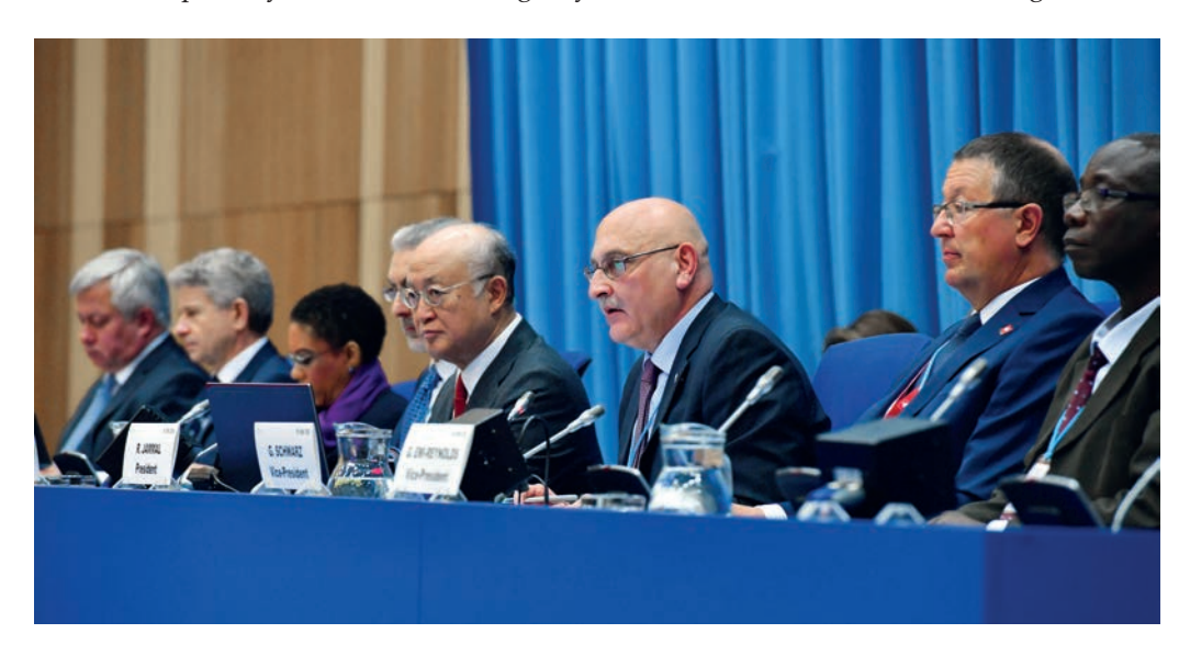
FIG. 1. Opening of the plenary session of the Seventh Review Meeting of the Contracting Parties to the Convention on Nuclear Safety, held at the Agency's Headquarters in Vienna, Austria.

The Agency hosted the Seventh Review Meeting of the Contracting Parties to the Convention on Nuclear Safety at the Agency's Headquarters from 27 March to 7 April (Fig. 1). More than 900 participants from 77 Contracting Parties took part. For the first time, countries that have signed the CNS but that have not yet adhered to it were invited to attend the opening plenary, the part of the final plenary when the summary report was adopted and the concluding press conference. Representatives of the media were also invited to the same sessions, which were webcast for the first time. All National Reports were made publicly available on the Agency's web site after the Review Meeting.