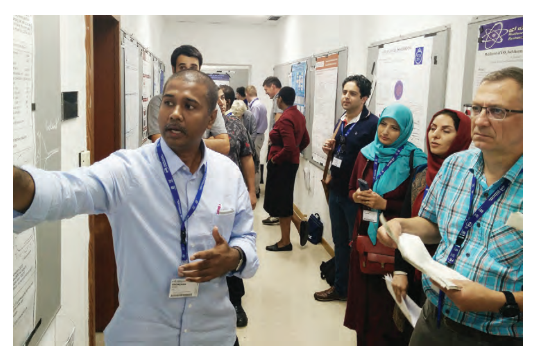
FIG. 2. Participants in the Joint ICTP–IAEA Workshop on Physics and Technology of Innovative Nuclear Energy Systems discuss various design concepts and nuclear fuel cycle options.

start-up of the China Experimental Fast Reactor (CEFR). In the CRP entitled 'Benchmark Analysis of FFTF Loss of Flow Without Scram Test', state of the art simulation tools will be used to model multi-physics phenomena. Under the CRP, 25 participants from 13 countries will validate the tools against observations from tests at the Fast Flux Test Facility (FFTF) in the United States of America aimed at demonstrating the reactor's capability to survive severe unprotected loss of flow accidents.